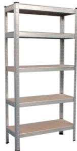
5 Shelf Storage Rack