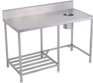
Soiled Dish Table