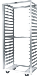
Tray Rack Trolley