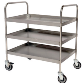
3 Tier Trolley