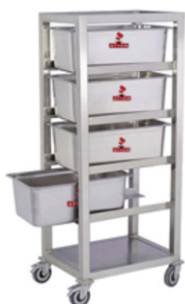
Gn Pan Trolley