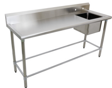
Table With A Sink