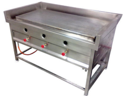
Dosa Hot Plate