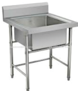
Single Sink Unit