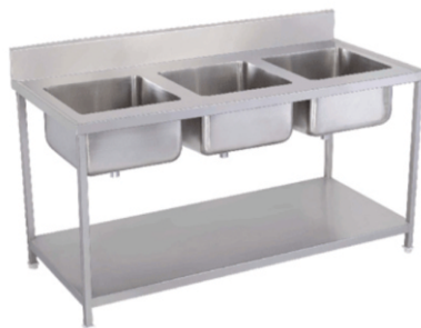
3 Sink Unit