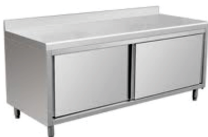
Table With Cabinet