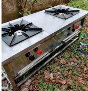
2 Burner Range