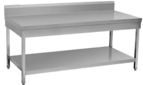
Table With 1 U/s