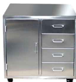
SS Cabinet With Drawers