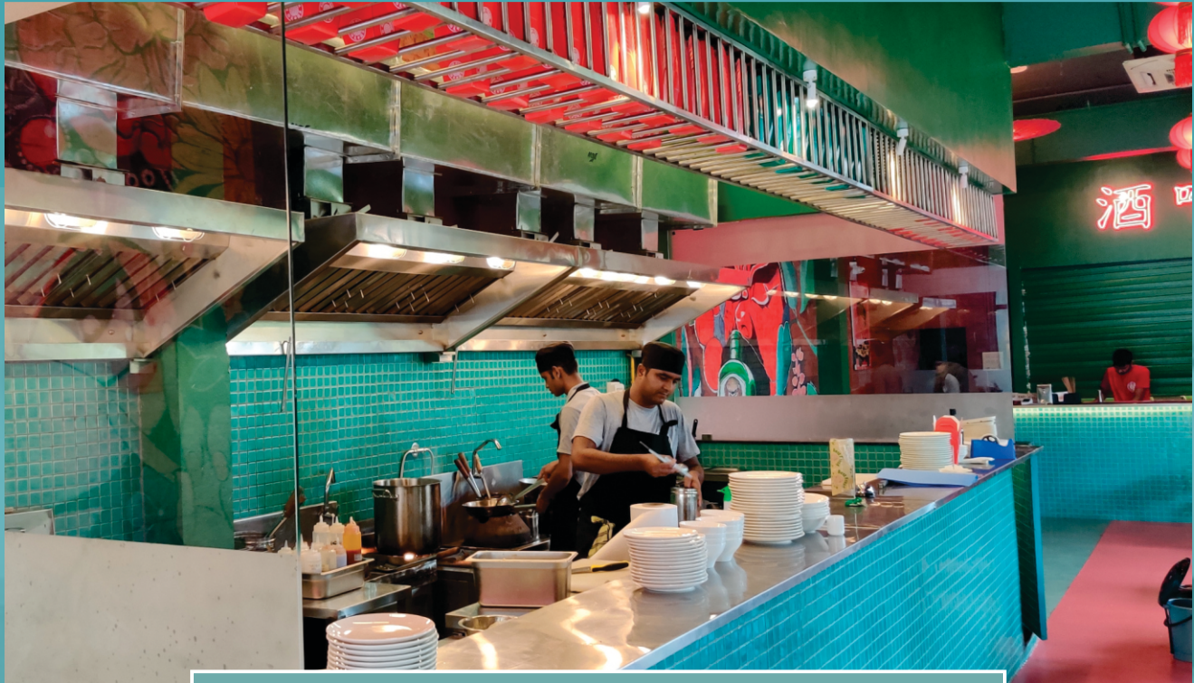
KITCHEN EXHAUST & FRESH AIR SYSTEMS

☎ 9588603302 | 7507806227 contact@sohamkitchens.com sohamkitchen99@gmail.com www.sohamkitchens.com Plot No. L-116A, Phase 3A, Verna Industrial Estate, Verna, Goa - 403710