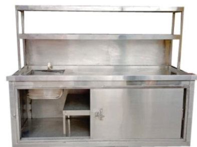
SS Juice Counter