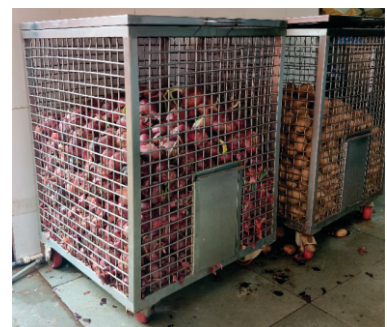
Onion Potato Rack