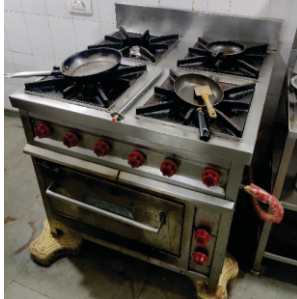
4 Burner Range